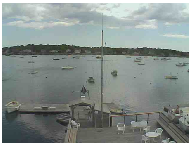
Early season view from MYC WebCam

MARBLEHEAD'S OLDEST YACHT CLUB MARBLEHEAD YACHT CLUB - 4 CLIFF STREET - MARBLEHEAD, MA 01945 781-631-9771 - WWW.MARBLEHEADYC.ORG